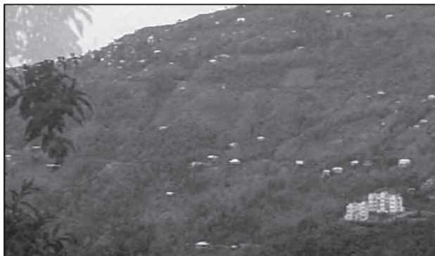
Fig. 4.3 : Dispersed settlements in Nagaland

with farms or pasture on the slopes. Extreme dispersion of settlement is often caused by extremely fragmented nature of the terrain and land resource base of habitable areas. Many areas of Meghalaya, Uttarakhand, Himachal Pradesh and Kerala have this type of settlement.