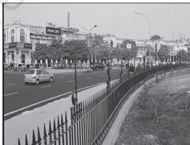
Fig. 4.4 : A view of the modern city

The British and other Europeans have developed a number of towns in India. Starting their foothold on coastal locations, they first developed some trading ports such as Surat, Daman, Goa, Pondicherry, etc. The British later consolidated their hold around three principal nodes – Mumbai (Bombay), Chennai (Madras), and Kolkata (Calcutta) – and built them in the British style. Rapidly