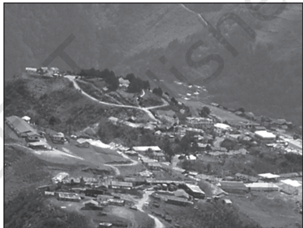
Fig. 4.2 : Semi-clustered settlements

Semi-clustered or fragmented settlements may result from tendency of clustering in a restricted area of dispersed settlement. More often such a pattern may also result from segregation or fragmentation of a large compact village. In this case, one or more sections of the village society choose or is forced to live a little away from the main cluster or village. In such cases, generally, the land-owning and dominant community occupies the central part of the main village, whereas people of lower strata of society and menial workers settle on the outer flanks of the village. Such settlements are widespread in the Gujarat plain and some parts of Rajasthan.