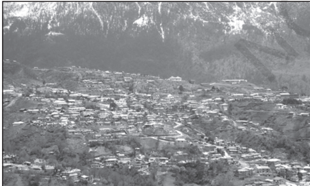
Fig. 4.1 : Clustered Settlements in the North-eastern states

The clustered rural settlement is a compact or closely built up area of houses. In this type of village the general living area is distinct and separated from the surrounding farms, barns and pastures. The closely built-up area and its